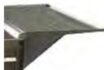
Escurrefritos lateral Side drip tray