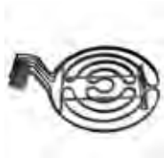
Resistencia Heating resistance