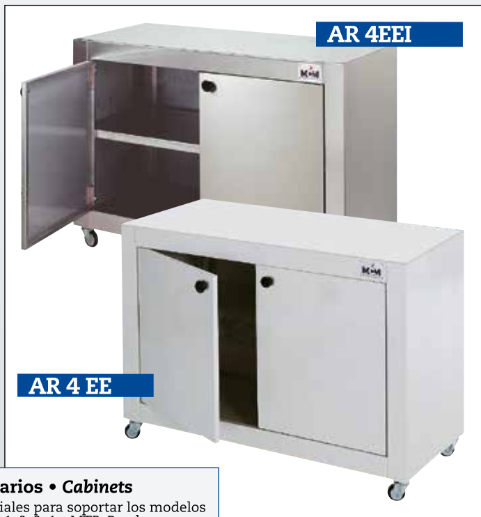
AR 4 EE