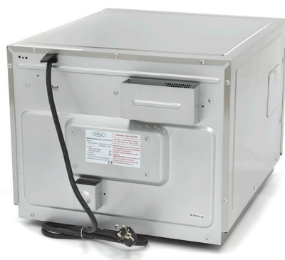
Stainless steel outside and inside