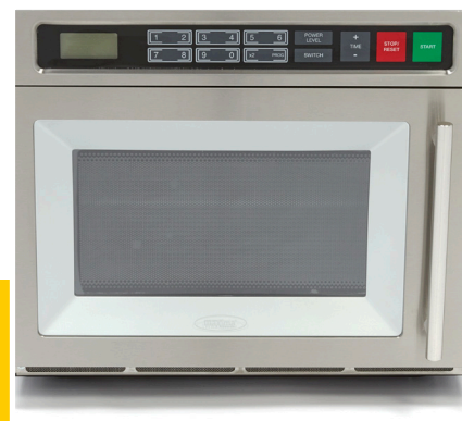
With 20 pre-programmed programs