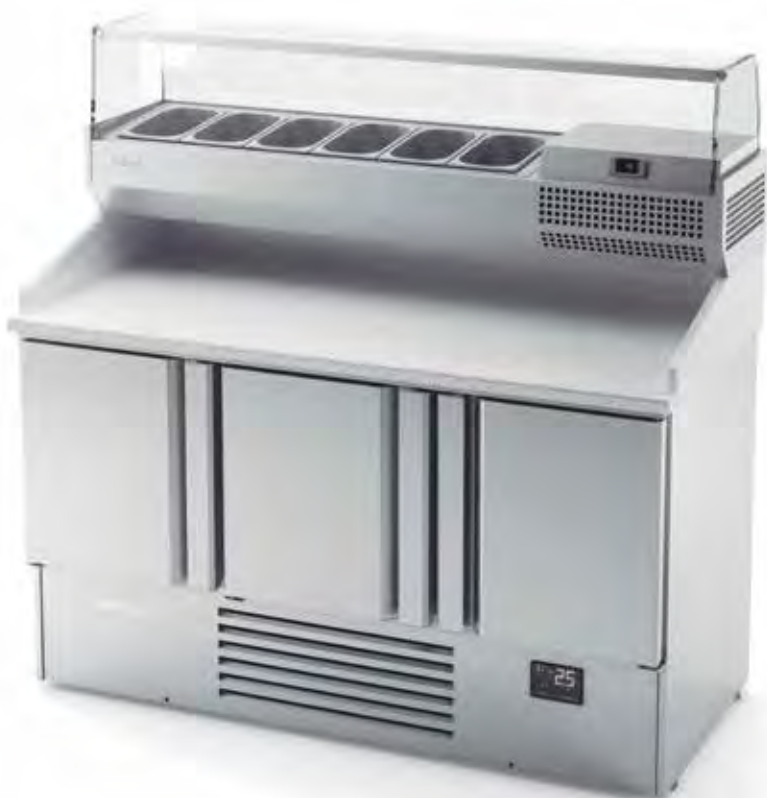
ME 1003 VIP