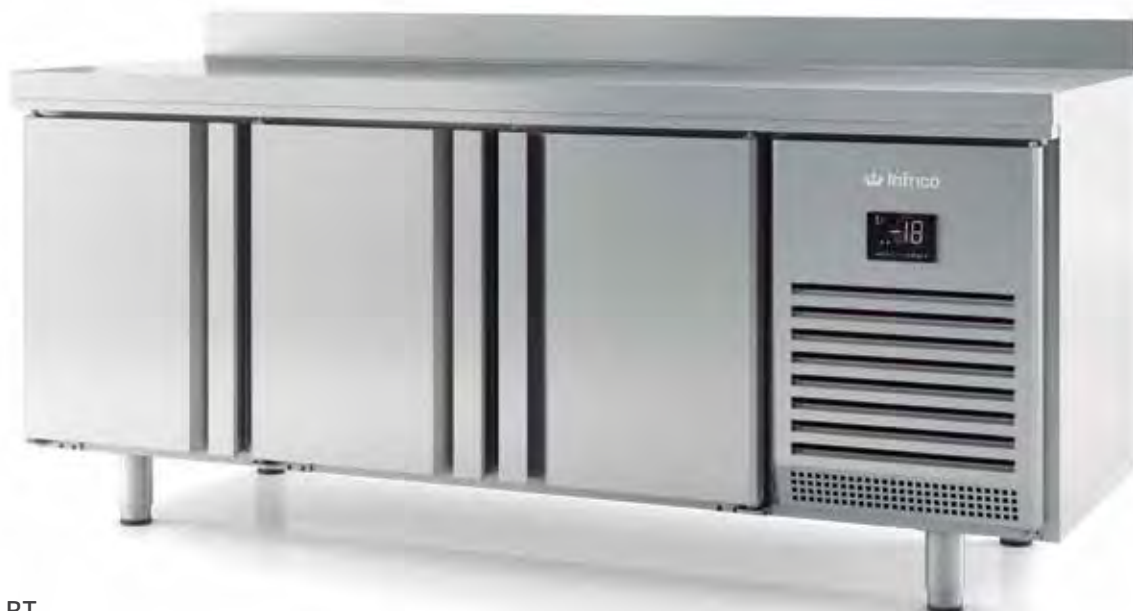
BMGN 1960 BT Gastronorm 1/1