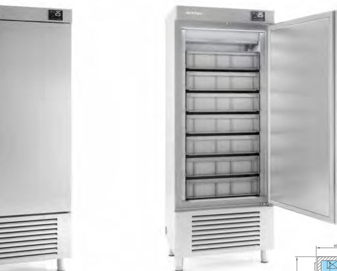
AP 850 T/F