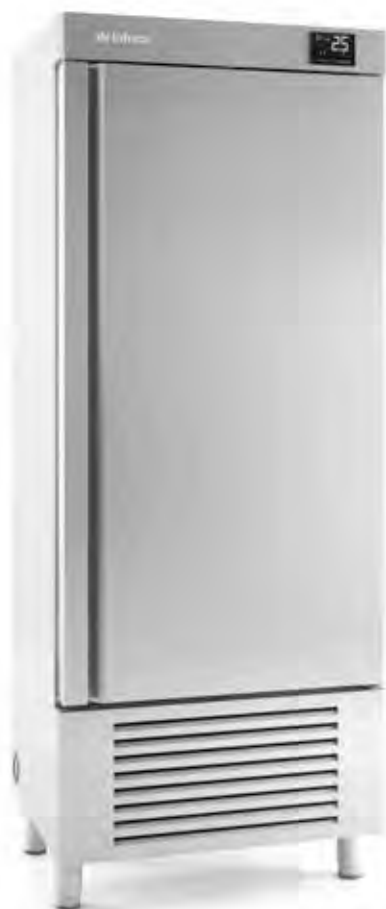
A 850 T/F