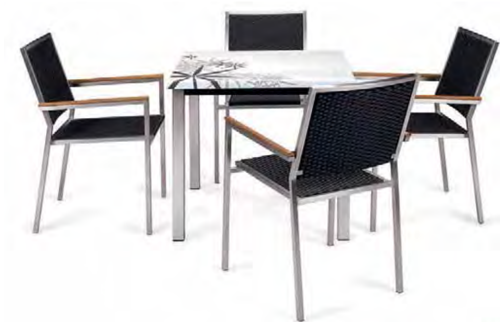
▲ MESA MOD. EROS DECO-INOX TABLERO STUDIO TOKIO