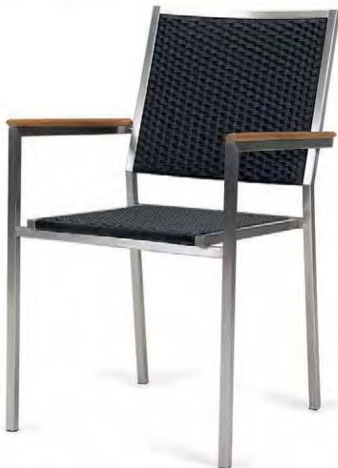
▶▶ SILLÓN MOD. SUIZA ACERO INOXIDABLE BRAZOS EN TEKA MÉDULA ANTRACITA