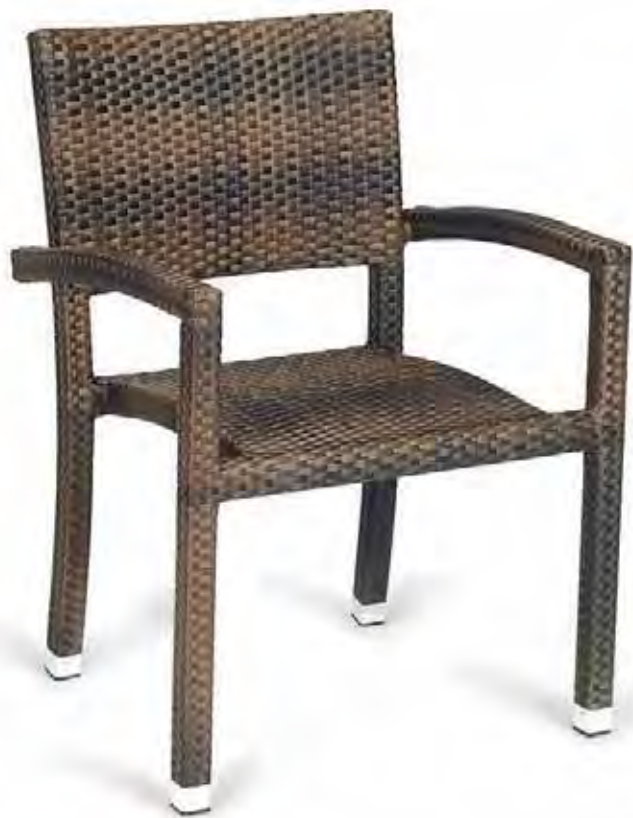
▲ SILLÓN MOD. DUOMO MÉDULA CAFÉ