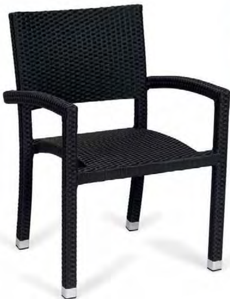
▲ SILLÓN MOD. DUOMO MÉDULA ANTRACITA