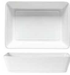
Rect. baker 30 ○ FIR302-WHI 29.7 x 22.2 H7.1 cm | 259.9 cl [1]