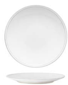
Round plate 28 ○ FIP281-WHI ● FIP281-SAG ● FIP281-GRY