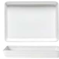
Tray 25 ○ FIR252-WHI 25.1 x 18.9 H3.2 cm [1]