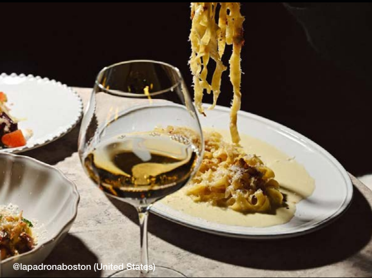
@lapadronaboston (United States)