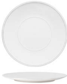
Round plate 34 ○ FIP343-WHI