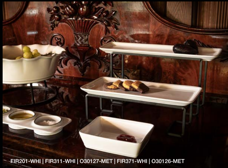
FIR201-WHI | FIR311-WHI | O30127-MET | FIR371-WHI | O30126-MET