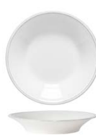
Deep round plate 25 ○ FIP261-WHI ● FIP261-SAG ● FIP261-GRY