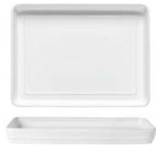
Tray 30 ○ FIR303-WHI 30.1 x 22.5 H3.2 cm [1]