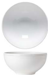
Serving bowl 24 ○ FIS241-WHI D24.4 H11.5 cm | 283.5 cl [1]