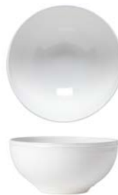
Serving bowl 21 ○ FIS211-WHI D21.4 H10.1 cm | 178 cl [1]