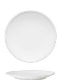
Round plate 22 ○ FIP221-WHI ● FIP221-SAG ● FIP221-GRY