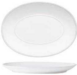
Oval platter 41 ○ FIA402-WHI 41 x 29.6 H3.9 cm [1]