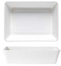
Rect. baker 25 ○ FIR251-WHI 25.3 x 18.6 H6.2 cm | 152.3 cl [1]