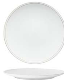
Round plate 31 ○ FIP311-WHI