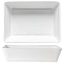
Rect. baker 35 ○ FIR351-WHI 34.9 x 26 H8.3 cm | 401.8 cl [1]