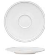
Tea saucer 17 ○ FIP171-WHI D17.1 H2 cm [6]