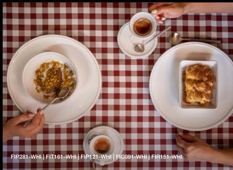
FIP281-WHI | FIT161-WHI | FIP121-WHI | FIC091-WHI | FIR151-WHI