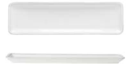
Rect. tray 37 ○ FIR371-WHI 36.8 x 10.4 H2.1 cm [1]