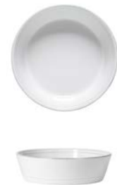
Mini pie dish 16 ○ FIT161-WHI D16.1 H4.6 cm | 46 cl [1]