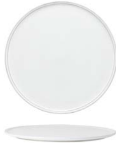
Round flat plate 34 ○ FIP331-WHI