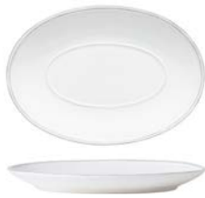
Oval platter 30 ○ FIA302-WHI 30.1 x 21 H3.1 cm [1]