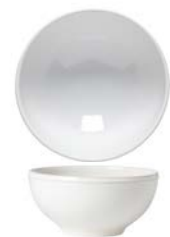
Bowl 16 ○ FIS161-WHI ● FIS161-SAG ● FIS161-GRY