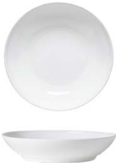
Serving bowl 34 ○ FIS341-WHI D33.6 H7.2 cm | 289.7 cl [1]