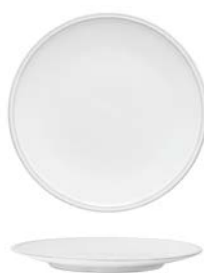
Round plate 26 ○ FIP264-WHI