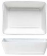
Rect. baker 15 ○ FIR151-WHI 15.2 x 11.5 H4.1 cm | 30.1 cl [1]