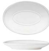
Oval platter 20 ○ FIA201-WHI 19.7 x 13.6 H2.9 cm [2]