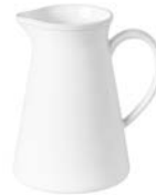
Pitcher 166 cl ○ FIZ212-WHI 20.2 x 14.8 H21.6 cm | 166 cl [1]