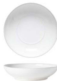
Low bowl 23 ○ FIP231-WHI