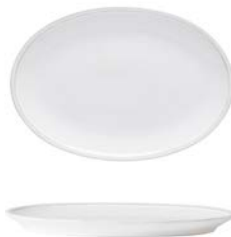
Oval plate 33 ○ FIP332-WHI