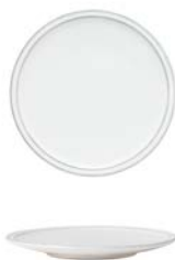
Round plate 16 ○ FIP161-WHI ● FIP161-SAG ● FIP161-GRY