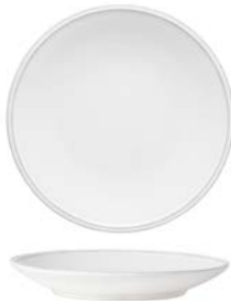
Deep round plate 28 ○ FIP284-WHI