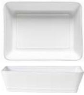
Rect. baker 20 ○ FIR201-WHI 20.2 x 15.2 H5.2 cm | 83 cl [1]