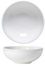
Low bowl 15 ○ FIS151-WHI D14.7 H5.5 cm | 39.6 cl [6]