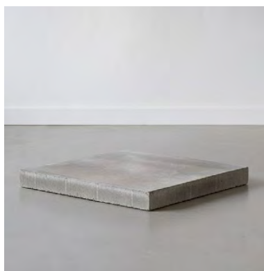
Losa de cemento / Concrete slab / Dalle en béton