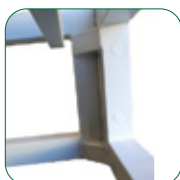
Pata reforzada Reinforced bed leg Pied renforcé