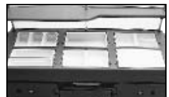
6 Well Top

GN Food Pan configuration for top row left to right includes: