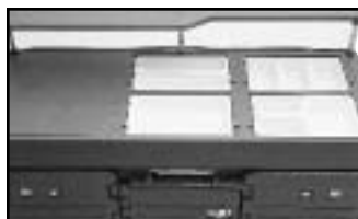
4 Well Top