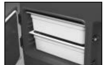
Two insulated holding compartments each hold up to 4 each GN 1/1 Full Size 6" (15 cm) deep Food Pans.