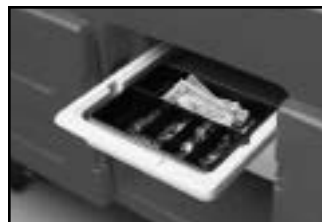
Open holding compartment holds cash drawer and box. (included)