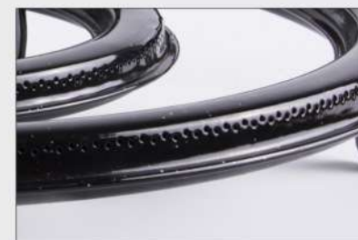
Salida lateral Lateral gas outlet Lateraler Gasaustritt Sortie laterale du gaz