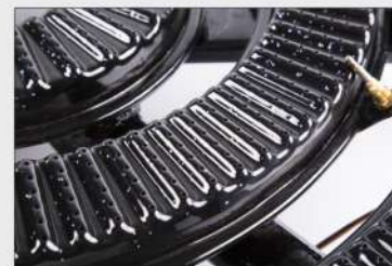
Termopar Thermocouple Thermoelement Thermocouple