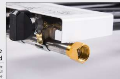
Valvula de seguridad Safety valve Sicherheitsventil Soupape de securite