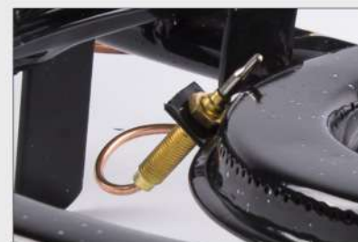
Termopar Thermocouple Thermolement Thermocouple