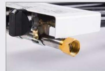
Valvula de seguridad Safety valve Sicherheitsventil Soupape de sécurité