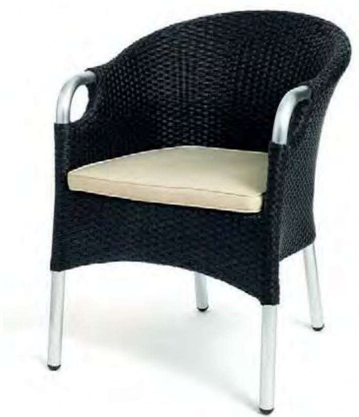
▶▶ SILLÓN MOD. PADUA MÉDULA ANTRACITA