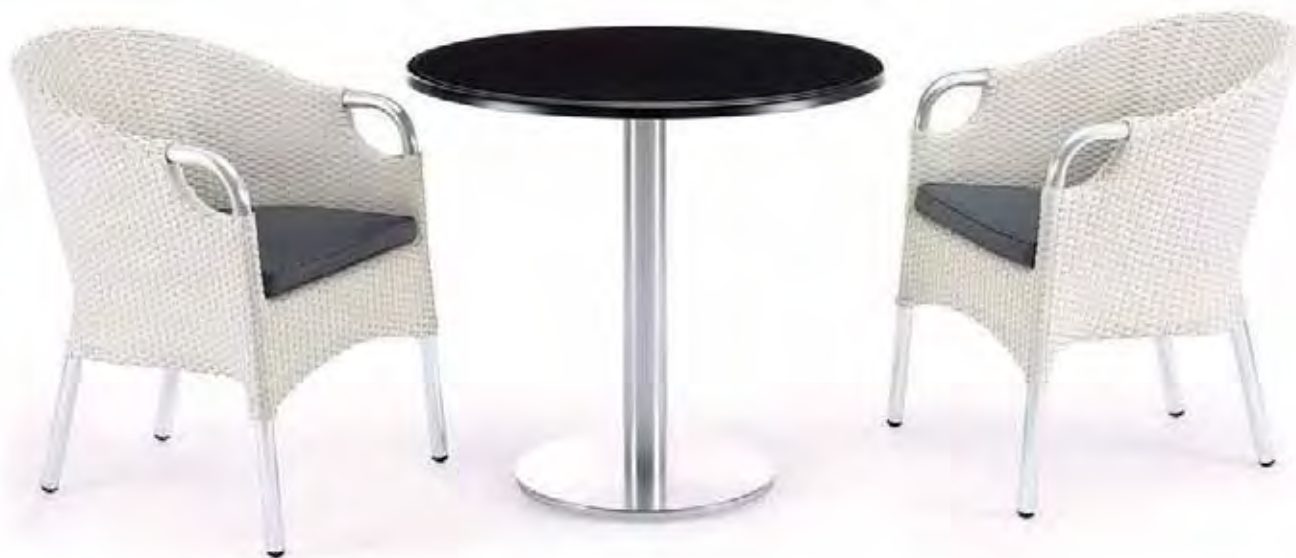
▲ MESA MOD. GRAN ROMA BASE ALUMINIO INTERIOR PLANCHA DE ACERO COLUMNA ALUMINIO TABLERO WENGUÉ