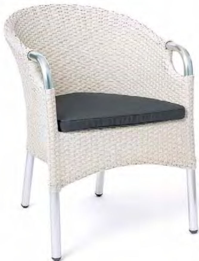
▶▶ SILLÓN MOD. PADUA MÉDULA BLANCO